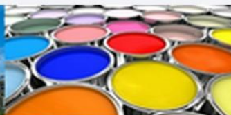
PAINTS & INKS