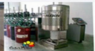
PAINT & INK DIPENSING MACHINE